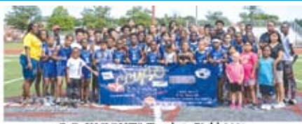
C.C. KNIGHTS Track & Field 2021