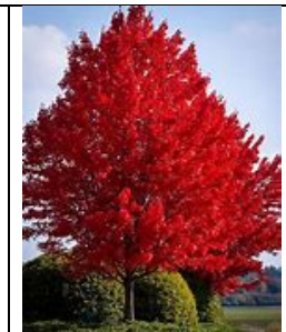
October Maple (Fall Color)