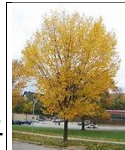
Princeton Elm (Fall Color)